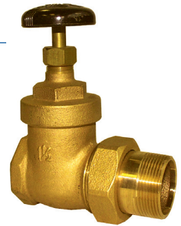
Pictured Model T-435