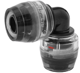
Pictured: 90° Elbow